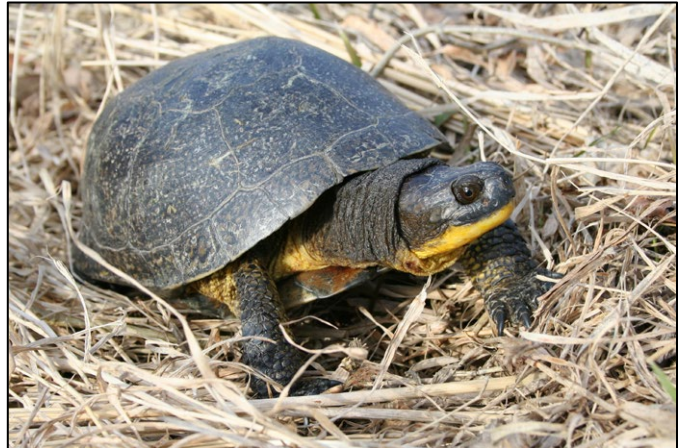
Blanding's Turtle

test the effectiveness of road underpasses and of road mortality mitigation strategies more generally. The applied conservation component would entail deploying GPS and VHF transmitters on a sample of turtles. To satisfy the academic requirements of a PhD, there would also be a need to develop more fundamental research goals, such as the energetic consequences of habitat selection or the link between habitat selection and fitness. The more fundamental goals will be developed by the PhD candidate and supervisors to best fit the candidate's interests within the broader objectives of the project.