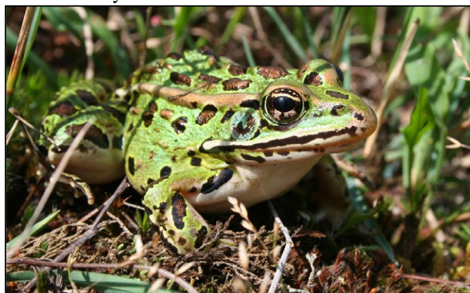
Northern Leopard Frog