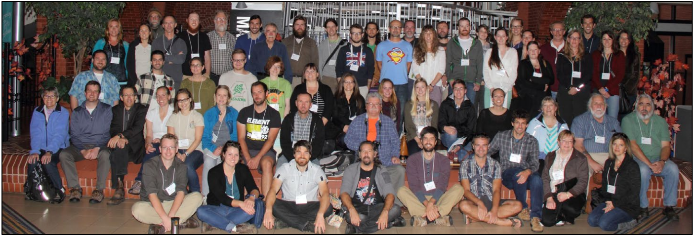
CHS membership at the 2015 AGM and conference in St. John, NB