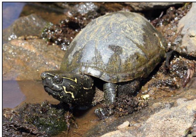
Eastern Musk (Stinkpot) Turtle