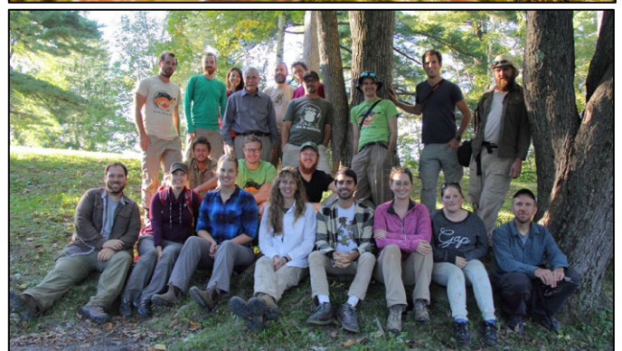
Northern Dusky Salamander observed on CHS the field trip (top; photo by Cowan Belanger) and group photo of some of our field trip participants at Odell Park (bottom; photo by Joe Crowley)