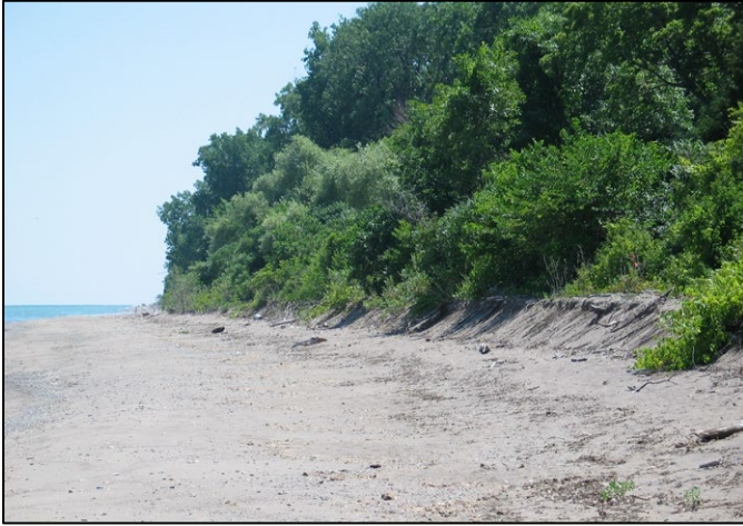
Figure 1. Storm erosion in Five-lined Skink habitat at Point Pelee

coastal environments can be and makes us wonder about the increasing severity and frequency of such events occurring in the future as a result of climate change.