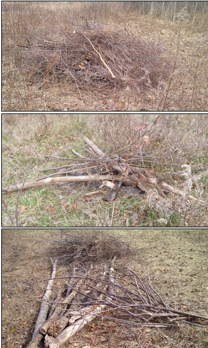
Figure 1. Brush pile (top), log pile (middle) and brush and log pile (bottom) created to enhance Massasauga gestation habitat

In the summer of 2014 we began by identifying ideal gestation habitat based on recent or historical use, canopy cover, presence of woody debris, woody vegetation cover and vegetation height. Then from late fall 2014 to winter 2015, our staff and volunteers conducted targeted habitat enhancement activities in order to improve gestation habitat. We enhanced four gestation areas (each ~1000 m 2 in size) by manually removing woody vegetation and then creating woody debris piles as sites for shelter and gestation (for a total of ~ 15 structures created). This work added to the ~ 10 structures that were created in the area by volunteers over the previous three years. We experimented with a few different approaches and materials during the creation of these features, including brush piles, log piles and combination brush and log piles (Figure 1).