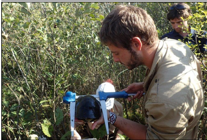
One of the START turtle sites in Muskoka (top) and a START volunteer processing a turtle