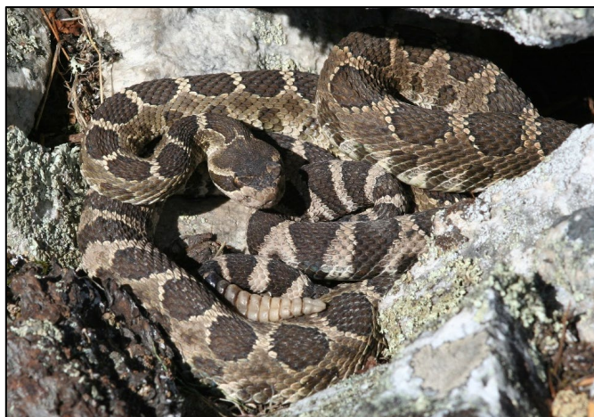
Western Rattlesnakes at a den site