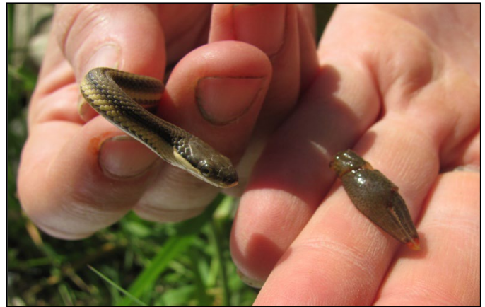
Figure 1. A Queensnake from the Lower Maitland River, Huron County, with the crayfish claw which the snake regurgitated upon capture

In Canada, the Queensnake is only found in southwestern Ontario in Essex, Lambton, Middlesex, Norfolk, Brant, Waterloo, Huron and Bruce counties. Over half of the reported sightings of this species are over 20 years old, leaving uncertainty regarding this species' current distribution and status. The Queensnake is a semi-aquatic snake that is highly elusive and apparently preys exclusively on native crayfish species found in its river and wetland habitats (Figure 1). Very little is known about Queensnake habitat requirements, and this information is crucial to inform conservation efforts. Even less is known about the sizes of extant populations or the level of gene-flow between populations and sub-populations, and these data are necessary to identify populations that may be at risk of inbreeding depression or extirpation.