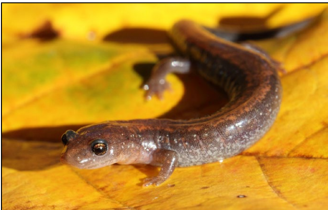
Eastern Red-backed Salamander

Rollinson N. and D. Hackett. 2015. Experimental assessment of agonistic behaviour, chemical communication, spacing, and intersexual associations of the red-backed salamander near its northern range limit. Canadian Journal of Zoology 93: 773-781