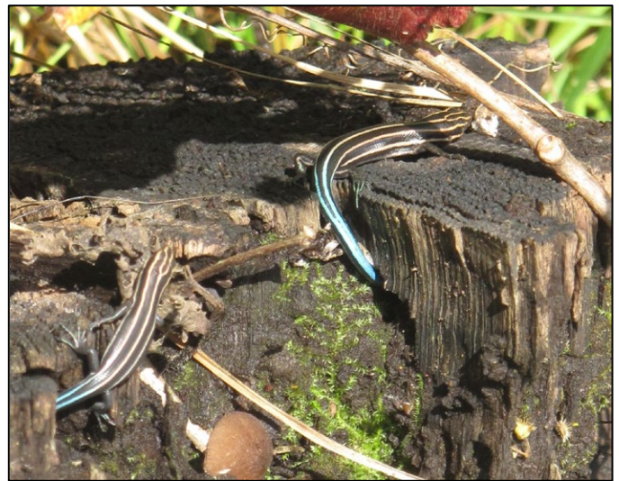
Figure 3. Five-lined skink hatchlings basking on a stump

In recent years, habitat restoration efforts through prescribed burns or hand/mechanical clearing at several locations have restored open area and are clearly benefiting Five-lined Skinks and other reptiles. One particular highlight was joining Jen McCarter and her Nature Conservancy Canada staff at the historic Oxley Poison Sumac Swamp near Harrow, Ontario where we were entertained by five skink hatchlings jockeying for best positions while basking on a large tree stump (Figure 3). We were all quite excited that the purchase and restoration of the site has been so effective – an example of sharing information and working towards common goals among agencies. We all left with greater optimism for the future plight of our species at risk.