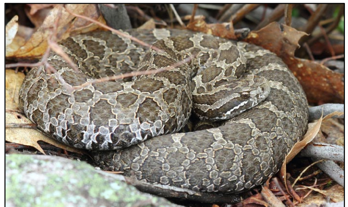
Massasauga Rattlesnake

As reptile populations worldwide decline, construction and monitoring of road mortality mitigation measures is becoming common. I studied the effectiveness of barrier fencing at preventing Eastern Massasauga rattlesnakes ( Sistrurus catenatus ) from gaining access to the road. I also tested whether ecopassages were effective at allowing Massasaugas to access habitat on both sides of the road. I determined that there was a reduction of Massasaugas on the road post-installation of barrier fencing. Data from various monitoring approaches showed that Massasaugas do indeed use the ecopassages to cross the road. I quantified the long-term effect of mitigation structures on the population viability of Massasaugas. A Population Viability Analysis revealed that post-mitigation construction, the study population has a low probability of extinction, suggesting that mitigation is effective at promoting a sustainable population. Analyzing the effects of road mortality at the population level is crucial to ensure that decision makers are adequately informed of the status of species-at-risk.