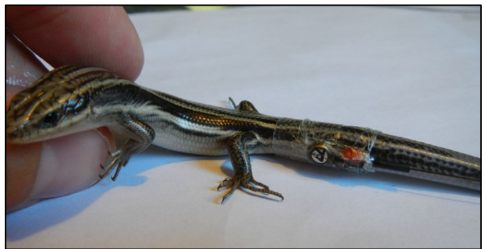
Figure 2. Five-lined Skink with a radio-transmitter

Perhaps the most amazing observations of movements were of a male who was found at the base of a live Black Oak ( Quercus velutina ) 25 m away from the cover board where he was found the previous day. Over the next five days this male was detected inside this partially hollowed oak tree at heights of >10 m. In