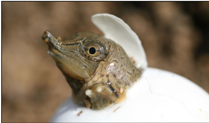
Scott Gillingwater and his field assistants with adult Spiny Softshell Turtles (top, photo by Alissa Fraser) and a hatchling Spiny Softshell Turtle emerging from an artificially incubated egg (bottom; photo by Scott Gillingwater)

Our Spiny Softshell research and recovery efforts began in 1994, and have included a number of activities, including: identifying and mitigating human-related threats; implementing recovery strategies to protect and recover reptiles at risk and their habitats; filling knowledge gaps through long-term surveys and research; improving and creating habitat; and increasing recruitment by protecting turtle nests and incubating eggs. When we started our work, one of the primary causes of recruitment failure in the Thames River Spiny Softshell population was mammalian egg predators (Raccoon, Striped Skunk, Red Fox, Coyote, Virginia Opossum and even Domestic Dogs). Predators took 98 to 100% of all softshell turtle eggs. Unfortunately, even with our protective caging to keep mammals away from eggs, nests were still lost due to annual flooding and increasing illegal collection. Over the past 15 years we have almost entirely transitioned to artificial incubation of eggs, which has allowed our hatching success rates to reach 89 to 95%, which is far greater than we were able to achieve in the field with nest protection! Of course, not all eggs are salvageable because of environmental conditions and predators that reach the nests before us, but we are increasing our success each year.