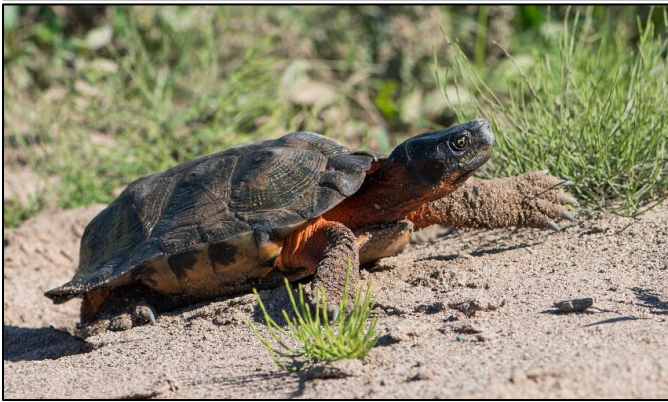
Wood Turtle habitat at Base Gagetown, New Brunswick (top;) and Wood Turtle observed on CHS field trip (bottom;)