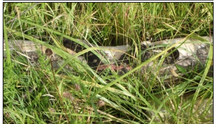
A volunteer installing an experimental artificial gestation site in November 2014 (top), and a gravid female Massasauga observed using the site for gestation in August 2015 (bottom)