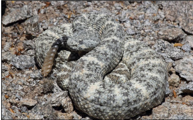
Speckled Rattlesnake ( Crotalus mitchellii ) near Phoenix, Arizona

dynamics and long-term trends are critical to informing effective conservation strategies for this species. Scott Gillingwater's work with the Spiny Softshell in the Thames River, which is also discussed in the Field Notes section of the issue, is another great example of a long-term project that is yielding some very interesting insights about species trends and management solutions.